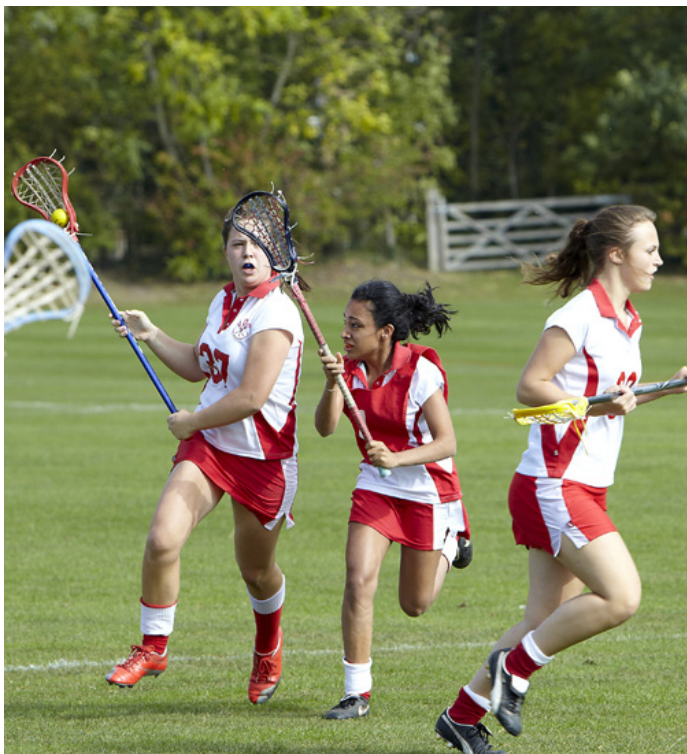
The Lady Eleanor Holles School in Hampton

He took the time to talk about his experience of the service and support received from Opus over the last 8 years.