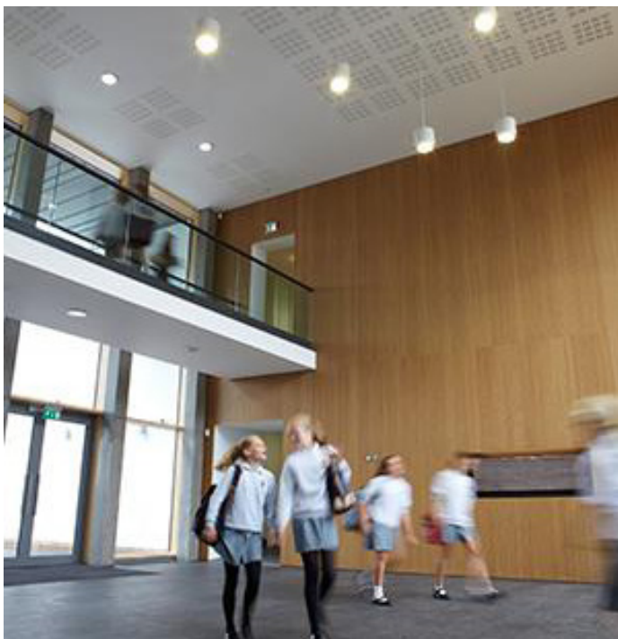
The Lady Eleanor Holles School in Hampton